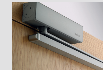
Slide arm Transom mounted pull side