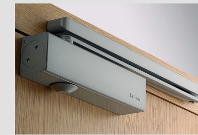
Slide arm Door mounted pull side