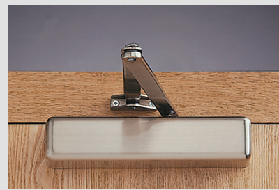
Projecting arm Regular fixing (door mounted pull side)