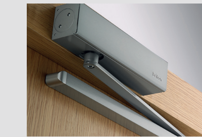
Slide arm Transom mounted push side