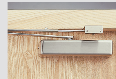
Projecting arm Parallel fixing (door mounted push side)