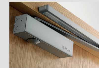
Slide arm Door mounted push side